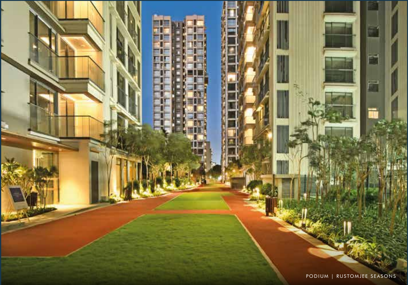
PODIUM | RUSTOMJEE SEASONS