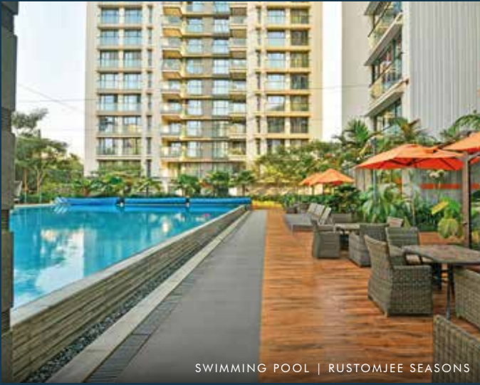
SWIMMING POOL | RUSTOMJEE SEASONS