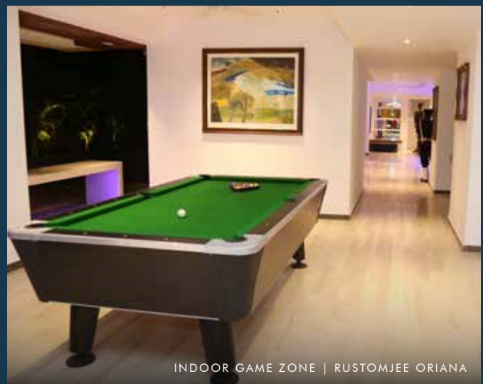
INDOOR GAME ZONE | RUSTOMJEE ORIANA