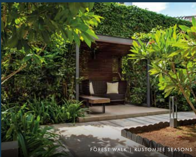
FOREST WALK | RUSTOMJEE SEASONS