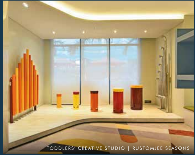
TODDLERS' CREATIVE STUDIO | RUSTOMJEE SEASONS