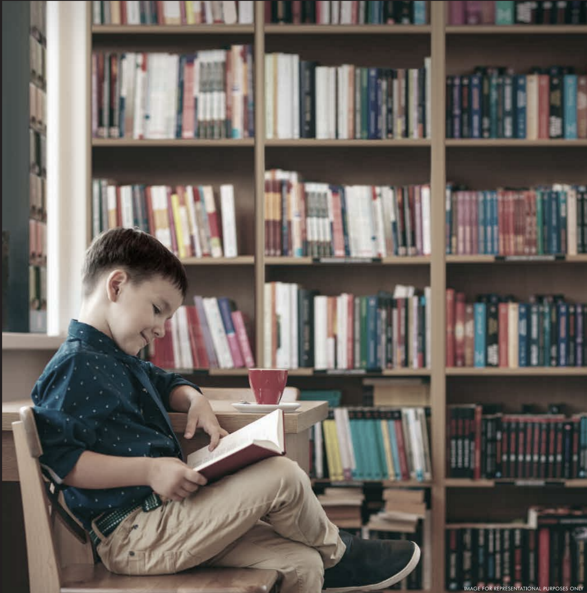
IMAGE FOR REPRESENTATIONAL PURPOSES ONLY