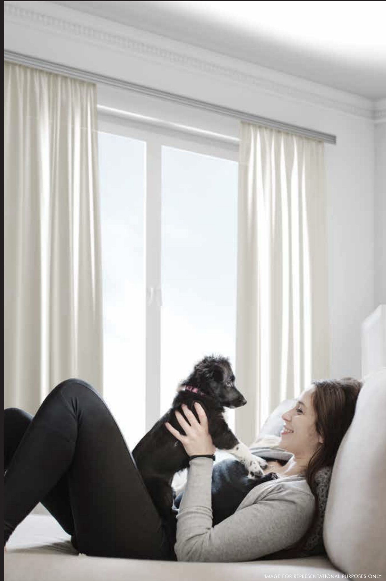
IMAGE FOR REPRESENTATIONAL PURPOSES ONLY