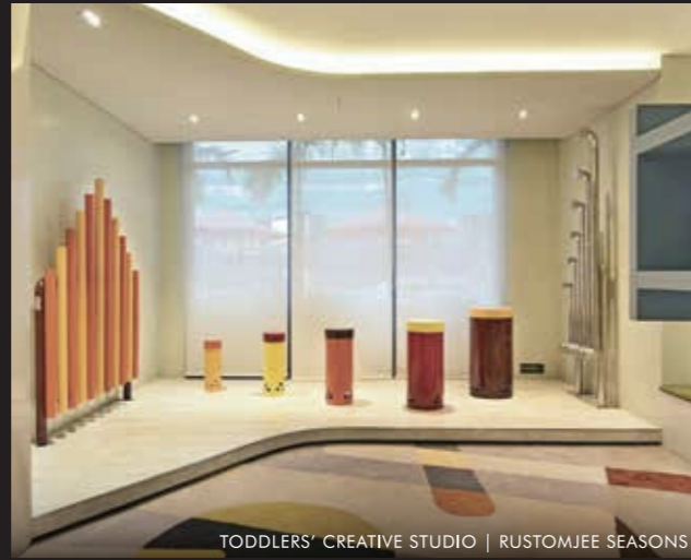
TODDLERS' CREATIVE STUDIO | RUSTOMJEE SEASONS