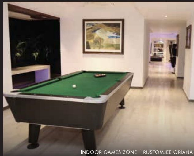
INDOOR GAMES ZONE | RUSTOMJEE ORIANA