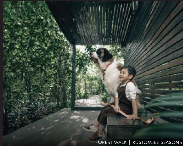
FOREST WALK | RUSTOMJEE SEASONS