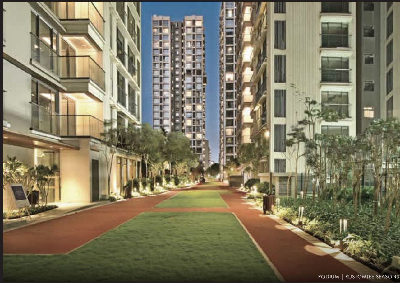
PODIUM | RUSTOMJEE SEASONS