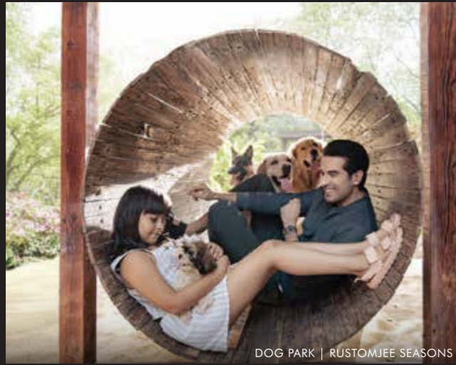
DOG PARK | RUSTOMJEE SEASONS